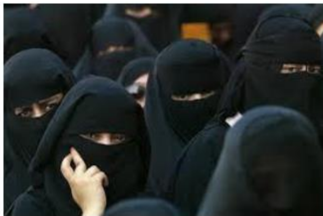
Women in Saudi Arabia do not have the right to vote