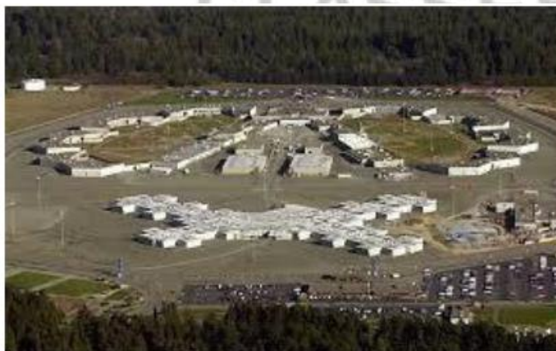
Prisons in Guantanamo Bay