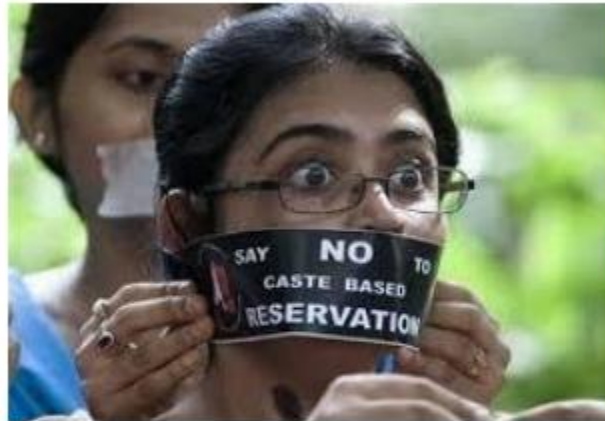
Protest against caste-based reservations