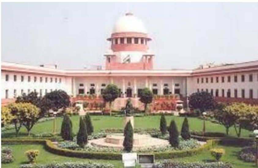
The Supreme Court of India in New Delhi

People who are not satisfied with the decision of the High Court can file cases in the Supreme Court.