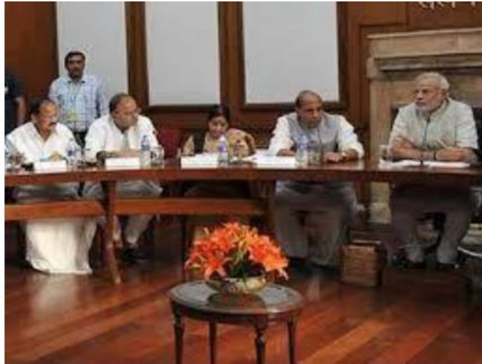
Cabinet – Inner ring of the Council of Ministers