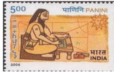
Postage stamp of Indian grammarian, Panini

Takshashila became famous as a place of learning due to its teachers' expertise. Among its noted pupils were the legendary Indian grammarian, Panini. He was an expert in language and grammar and authored one of the greatest works on grammar called Ashtadhyayi . Jivaka, one of the most renowned physicians in ancient India, and Chanakya (also known as Kautilya), a skilled exponent of statecraft, both studied here. Students came to Takshashila from Kashi, Kosala, Magadha and also from other countries in spite of the long and arduous journey they had to undertake.