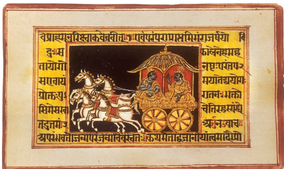
Fig. 1 A page from a south Indian manuscript of the Bhagavad Gita.