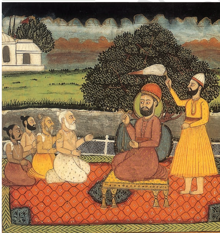
Fig. 10 Baba Guru Nanak as a young man, in discussion with holy men.

Before his death in 1539, Baba Guru Nanak appointed one of his followers as his successor. His name was Lehna but he came to be known as Guru Angad, signifying that he was a part of Baba Guru Nanak himself. Guru Angad compiled the compositions of Baba Guru Nanak, to which he added his own in