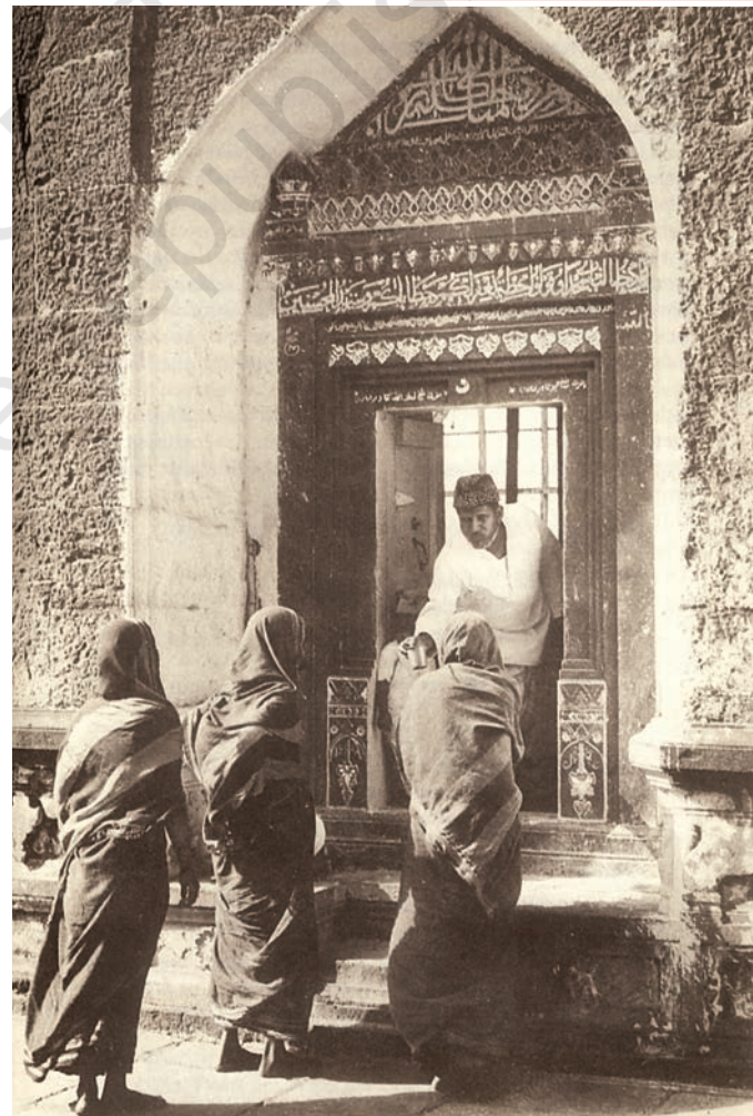
Fig. 6 Devotees of all backgrounds visit Sufi shrines.

Often people attributed Sufi masters with miraculous powers that could relieve others of their illnesses and troubles. The tomb or dargah of a Sufi saint became a place of pilgrimage to which thousands of people of all faiths thronged.