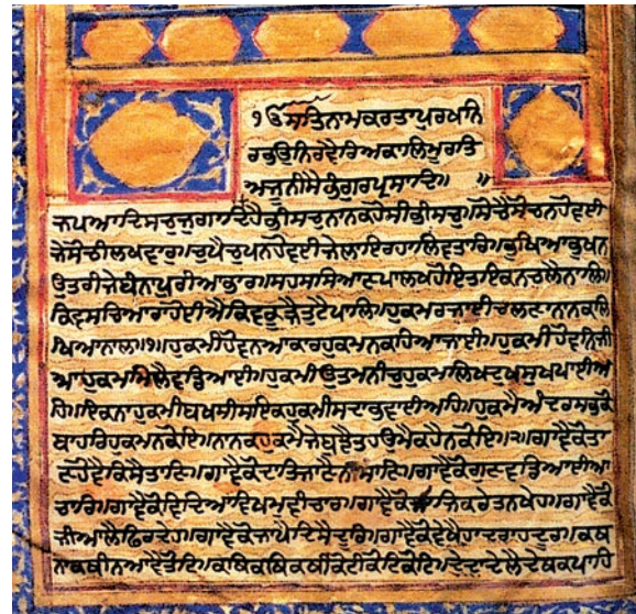
Fig. 11 An early manuscript of the Guru Granth Sahib.

a new script known as Gurmukhi. The three successors of Guru Angad also wrote under the name of “Nanak” and all of their compositions were compiled by Guru Arjan in 1604. To this compilation were added the writings of other figures like Shaikh Farid, Sant Kabir, Bhagat Namdev and Guru Tegh Bahadur. In 1706, this compilation was authenticated by Guru Tegh Bahadur’s son and successor, Guru Gobind Singh. It is now known as Guru Granth Sahib , the holy scripture of the Sikhs.