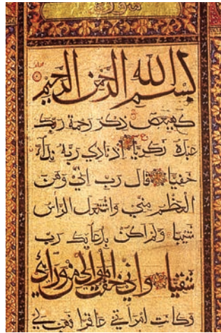
Fig. 5 A page from a manuscript of the Quran, Deccan, late fifteenth century.

A large number of Sufis from Central Asia settled in Hindustan from the eleventh century onwards. This process was strengthened with the establishment of the Delhi Sultanate (Chapter 3), when several major Sufi centres developed all over the subcontinent. The Chishti silsila was among the most influential orders. It had a long line of teachers like Khwaja Muinuddin Chishti of Ajmer, Qutbuddin Bakhtiar Kaki of Delhi, Baba Farid of Punjab, Khwaja Nizamuddin Auliya of Delhi and Bandanawaz Gisudaraz of Gulbarga.