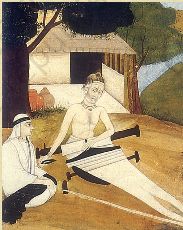
Fig. 9 Kabir working on a loom.