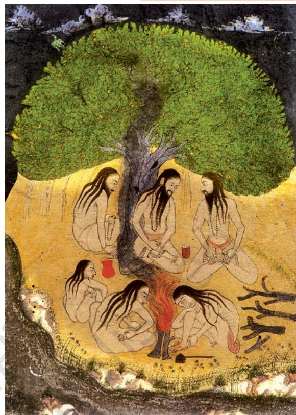
Fig. 3 A fireside gathering of ascetics.

A number of religious groups that emerged during this period criticised the ritual and other aspects of conventional religion and the social order, using simple, logical arguments. Among them were the Nathpanthis, Siddhacharas and Yogis. They advocated renunciation of the world. To them the path to salvation lay in meditation on the formless Ultimate Reality and the realisation of oneness with it. To achieve this, they advocated intense training of the mind and body through practices like yogasanas , breathing exercises and meditation. These groups became particularly popular among “low” castes. Their criticism of conventional religion created the ground for devotional religion to become a popular force in northern India.