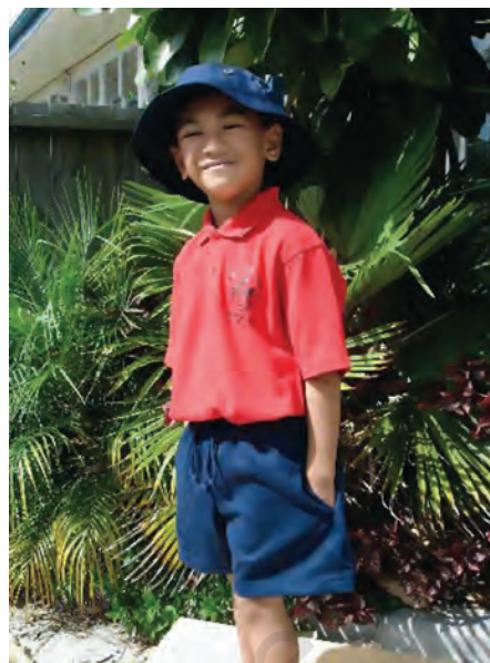
A Class VII Samoan child in his school uniform.

From Class VI onwards, boys and girls went to separate schools. The girls' school was designed very differently from the boys' school. They had a central courtyard where they played in total seclusion and