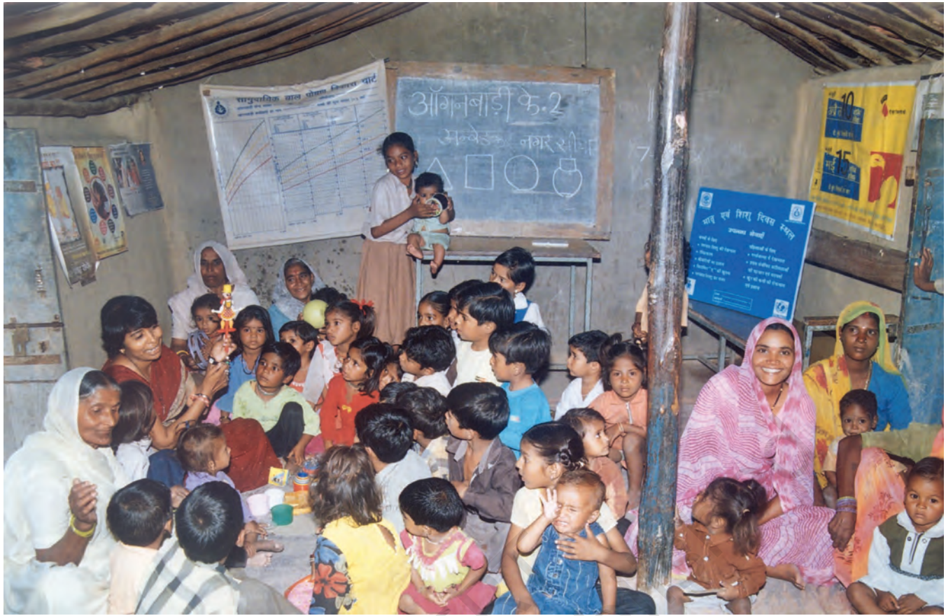
Children at an Anganwadi centre in a village in Madhya Pradesh.

This naturally has an impact on whether girls can attend school. It determines whether women can work outside the house and what kind of jobs and careers they can have. The government has set up anganwadis or child-care centres in several villages in the country. The government has passed laws that make it mandatory for organisations that have more than 30 women employees to provide crèche facilities. The provision of crèches helps many women to take up employment outside the home. It also makes it possible for more girls to attend schools.