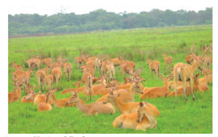
Rhino and deer in Kaziranga National Park