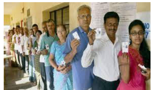
Holding free and fair elections is a major challenge faced by any democratic country today

• In most democratic countries, free and fair elections are held regularly. However, many countries still experience rigging of elections which is the biggest challenge which a