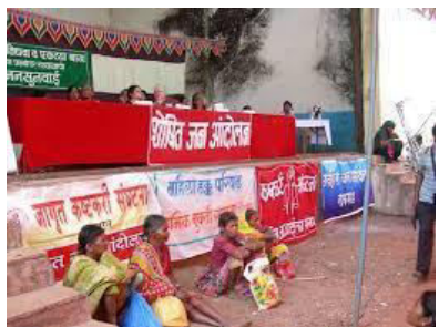
Even a popularly elected democratic government may not ensure smooth economic development

We can conclude that though democracy is the best form of government, it has not been able to reduce economic inequalities in society. Sometimes, even a government elected mostly by the poor people does not resolve the issue of poverty in the country. For example, in Bangladesh, more than 50% of its population lives below the poverty line, still the government has failed to work for the upliftment of its people.