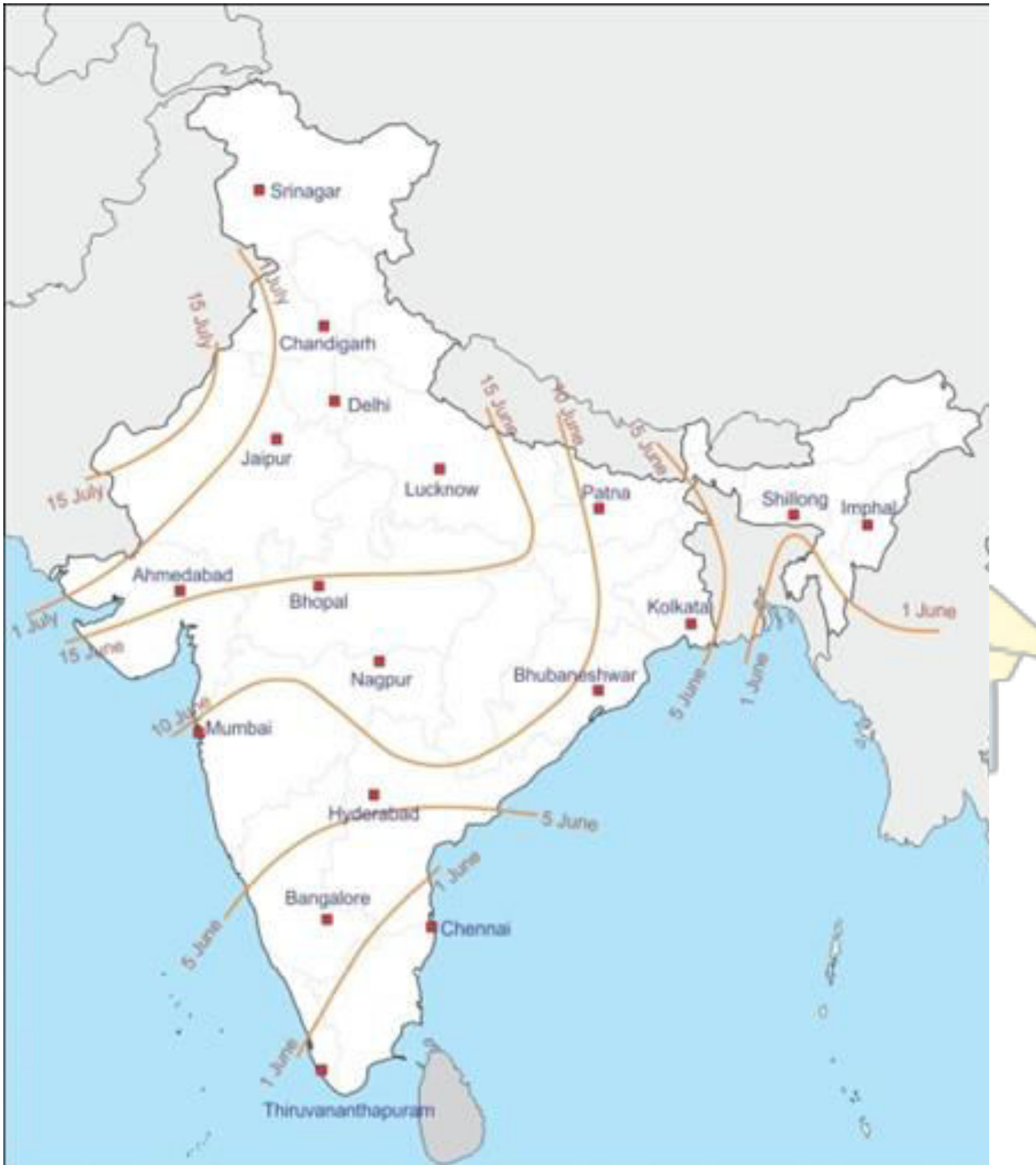
Map showing direction of Southwest monsoon winds in India