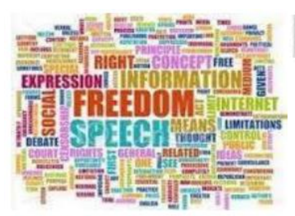
Right to Freedom is an important right guaranteed to the people of India.