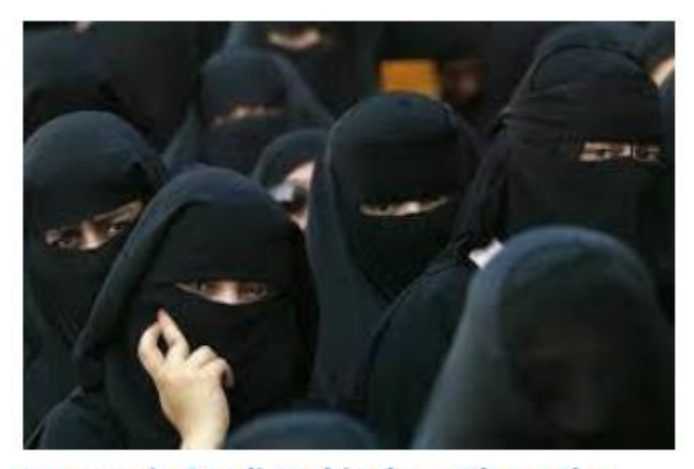
Women in Saudi Arabia do not have the right to vote