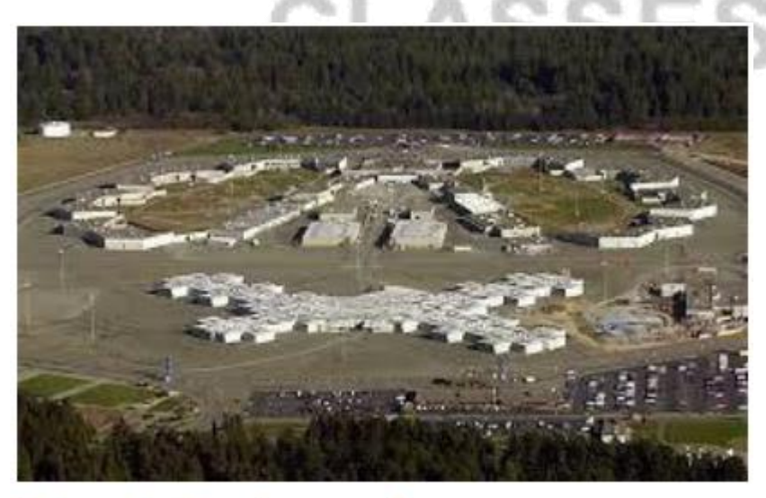
Prisons in Guantanamo Bay

The Massacre of Ethnic Albanians in Kosovo